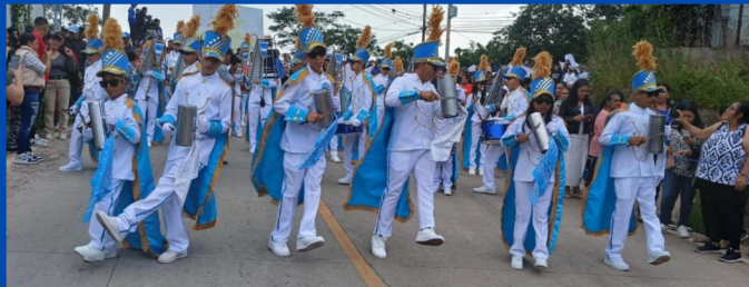
(Matthew 28: 18-20 & Jeremiah 17:7-8)