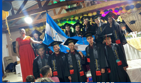
Prayer request for 2026

He who calls you is faithful, who also will do it 1st Thess: 5:24